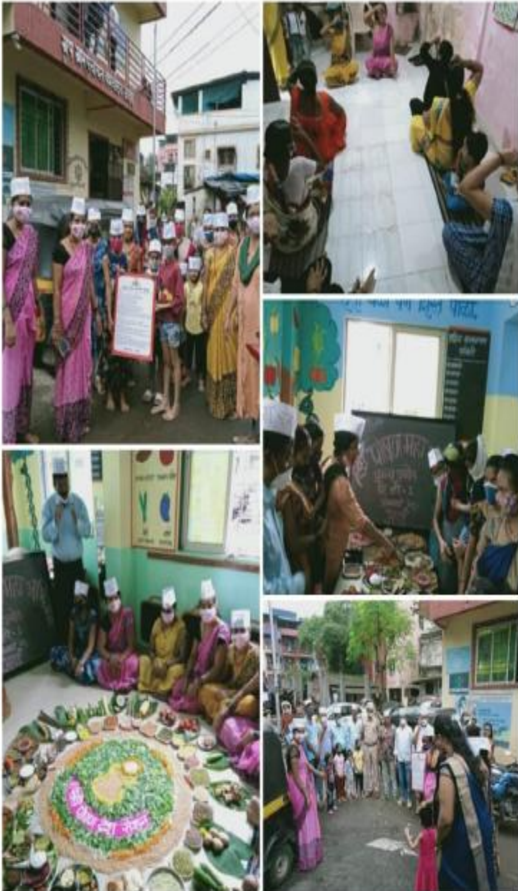
Suposhit Bharat- Adopted village At Post- Nere, Tal- Panvel, Dist- Raigad